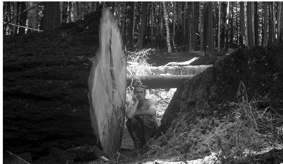
Giant old-growth cut in unit 1 of the Horse timber sale, the first Biscuit sale to be cut.